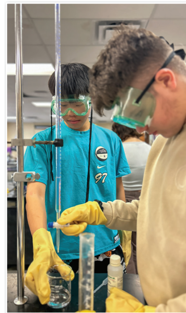
Hands-on learning in the classroom.