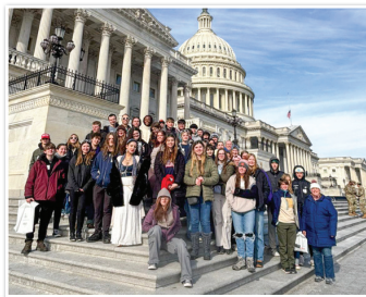
History students in the U.S. Capitol.

Students from pre-kindergarten through high school benefit from hands-on learning through engaging classroom activities, field trips, and after-school clubs and athletics. These experiences spark curiosity and deepen their understanding of "The World Beyond Middleburgh." By offering these opportunities, MCS prepares students for the future—wherever their journey may take them.