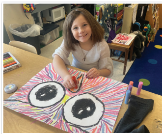
MCS offers over 35 clubs and 15 athletics programs.