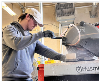
Fifty students attend Career & Technical Education programs through BOCES.