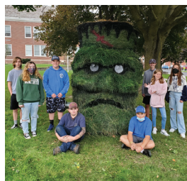
Team building and community outreach activity. MCS Advisories created #MiddleburghScarecrows to display for the Fall Festival. Check out more pictures on Instagram.