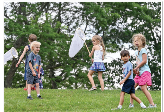
Schoharie River Center Summer Enrichment

Each summer, MCS provides additional student opportunities and partners with the Joshua Project and the Joint Youth Commission to host additional community services.