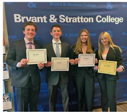
Future Business Leaders of America Club