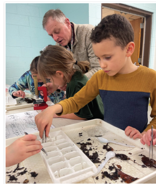
MAP After-School Program