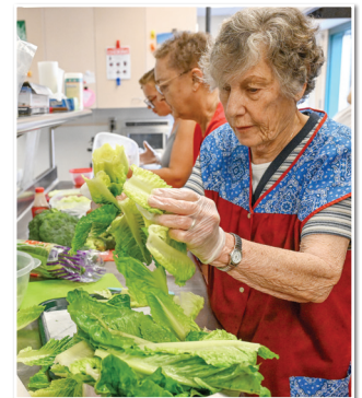
Joshua Project Summer Meals Program